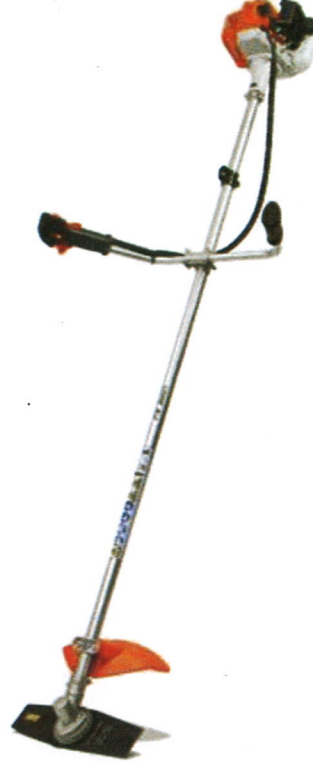
BRUSH CUTTER STIHL FS3001